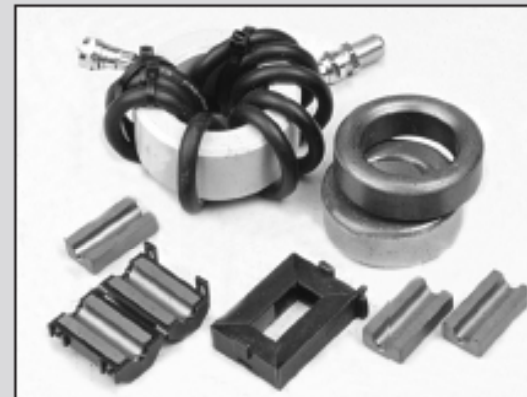
Figure 9.4 — Ferrite is a ceramic magnetic material used to make choke filters for RFI suppression. It is available in many different forms: rings (toroids), rods, and beads. Cables can be passed through or wound on these cores to prevent RF signals from flowing along their outside surfaces.

Ferrite is available as round cores (toroids), rods and beads shown in Figure 9.4 . Wires or cables are then wound on or passed through the ferrite forms. Beads are made large enough that they can be slipped over coaxial cables and secured with tape or a locking wire-tie. A wire or cable wound on such a ferrite core forms an RF choke.